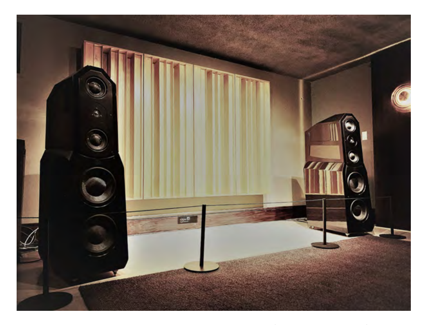
The Grand Central Hotel listening lounge, featuring a pair of massive EgglestonWorks Viginti loudspeakers