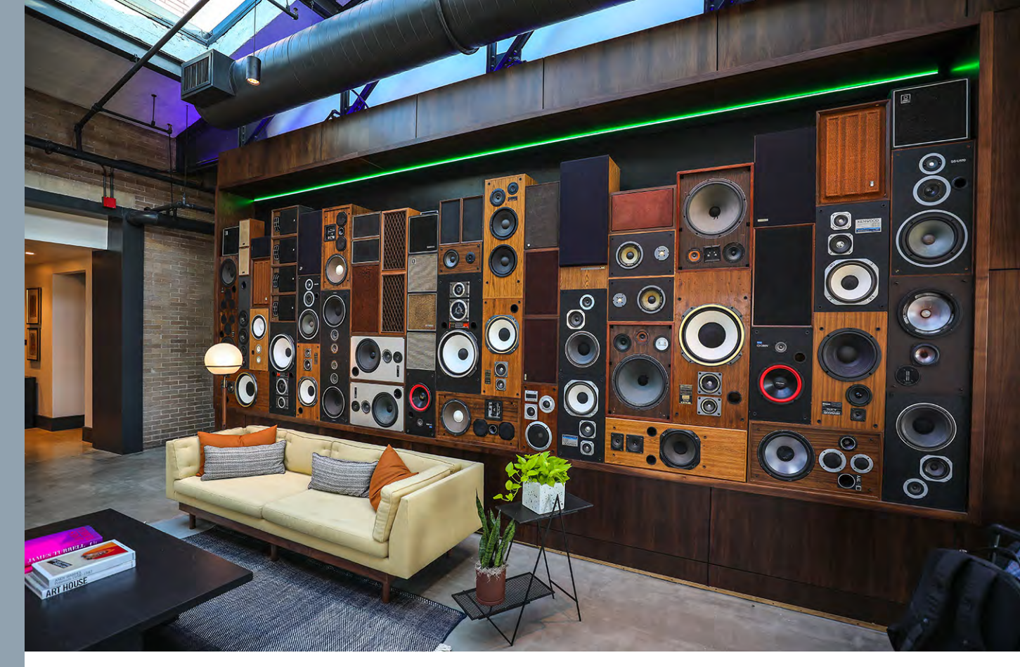
The loudspeaker sculpture creates a unique vibe that screams Rock & Roll!

Founded in 1996, EgglestonWorks is a boutique loudspeaker manufacturer proudly based in Memphis, TN—the birthplace of Rock'n'Roll and also home to Sun Records, Gibson Guitars and a colorful music legacy that has energized the city for many decades. EgglestonWorks is dedicated to creating loudspeakers that merge accuracy and musicality with unrivalled aesthetic beauty. Since the company's first designs were conceived, the underlying goal of all EgglestonWorks loudspeakers has been to strike that powerful, emotional chord naturally present in live music, to recreate the palpable realism of a live performance, complete and authentic to the most miniscule detail.