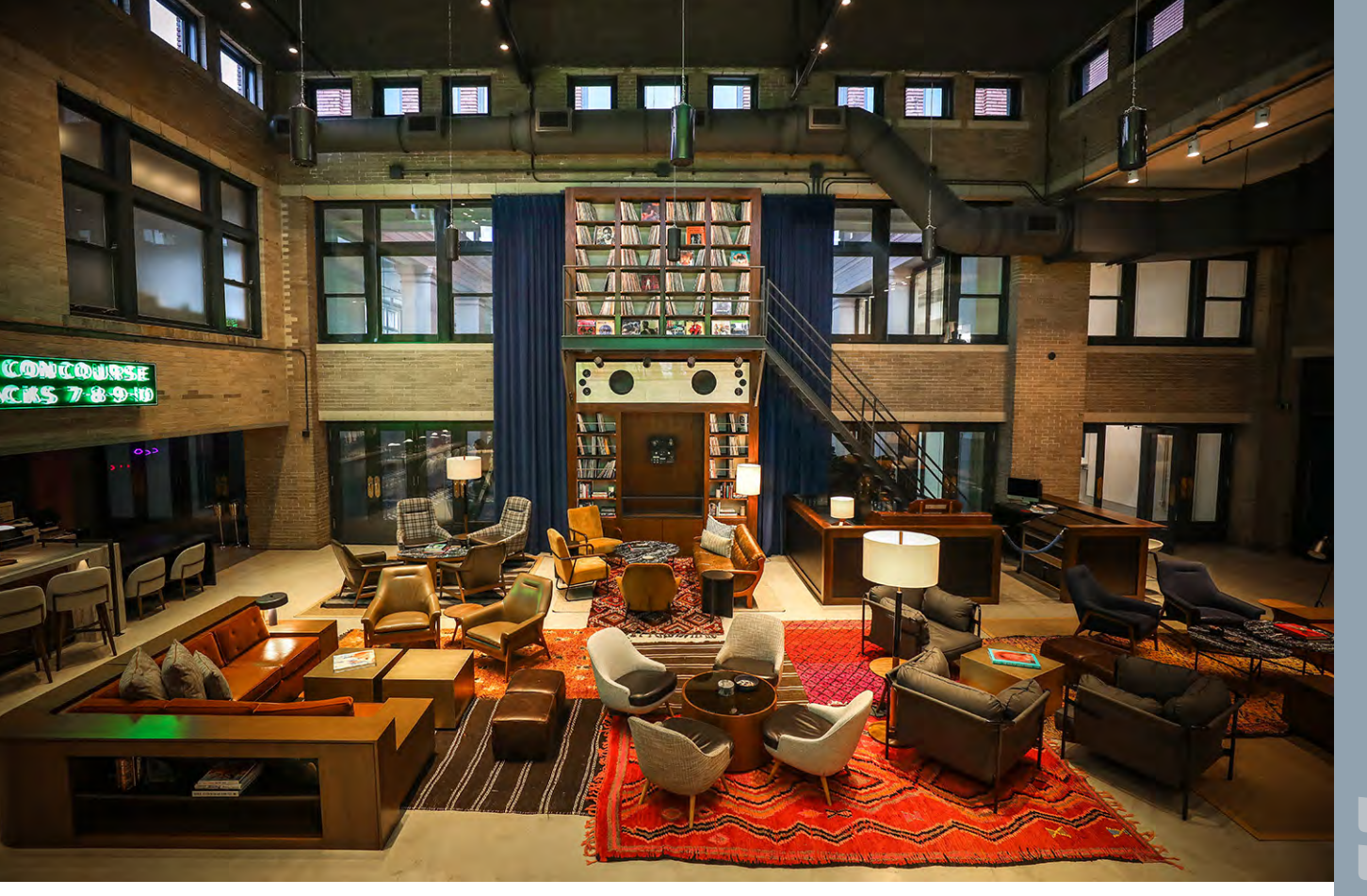
The bar and lounge area—note the massive custom speaker and subtle pendant speakers integrated into the décor.

Thompson engineered custom pendant speakers from 6-inch composite stock that is reinforced with carbon fiber and